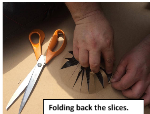
Folding back the slices.

hipyard, Historic Dockyard, Chatham, Kent, ME4 4TZ Company Reg Number: 8929811 VAT Number: 139 4155 07 e-Mail: sales@trimnet.co.uk Tel: 01634 244844