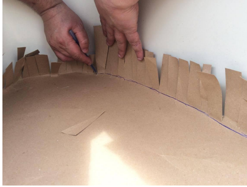
Line drawn in the crease of the folds.