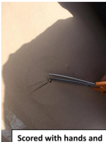
Scored with hands and made hole with scissors to start 'Pizza Cutting'