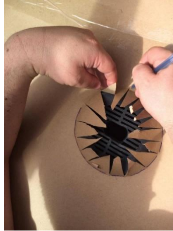
Line drawn around seat/tables bases.